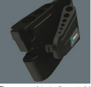
The wear-resistant clip material ensures that the L-keys are securely held yet are easy to remove.