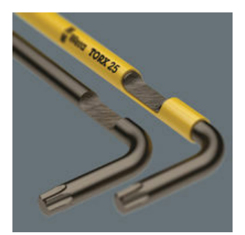
L-keys with a thermoplastic sleeve are manufactured out of easy-togrip, circular material. The sleeve ensures that work is safe and comfortable even at low temperatures. High corrosion protection features thanks to the special BlackLaser surface treatment. Colour coding and large stamp to enable the desired L-key to be easily located.